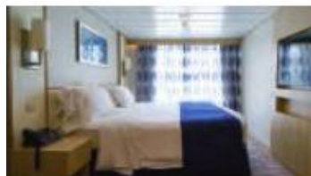
標準陽台套房 Junior Suite