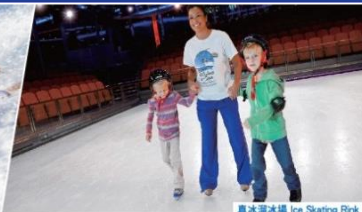
真冰溜冰場 Ice Skating Rink