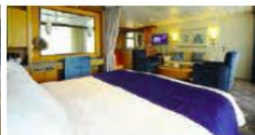
豪華陽台套房 Grand Suite